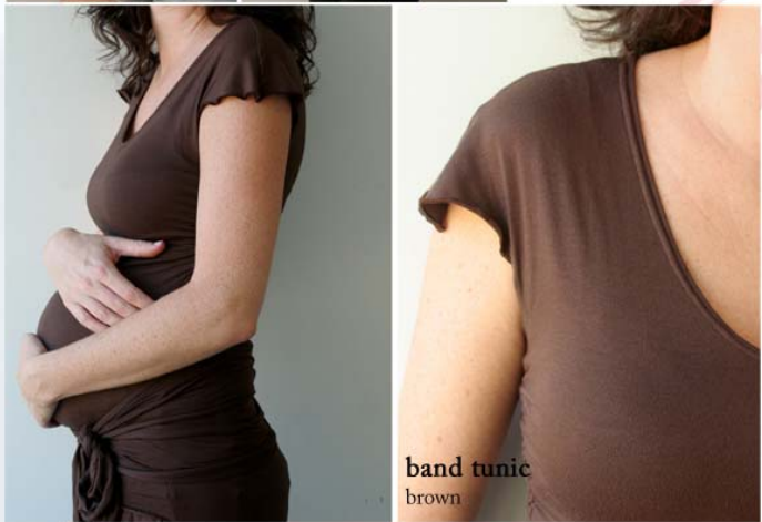
band tunic brown