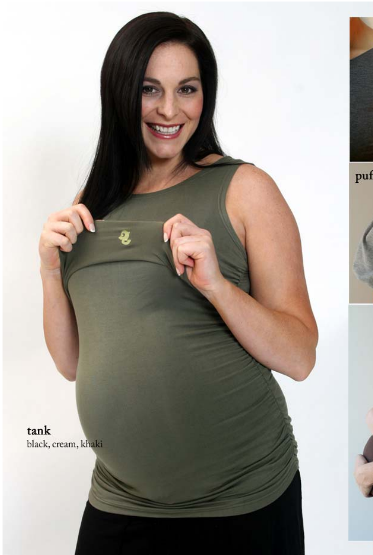
tank black, cream, khaki