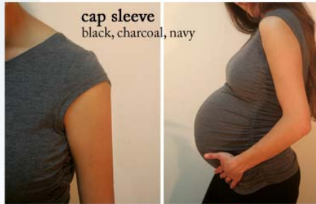
cap sleeve black, charcoal, navy