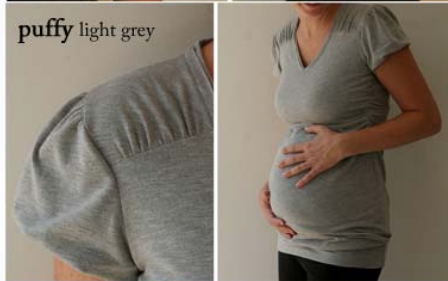
puffy light grey